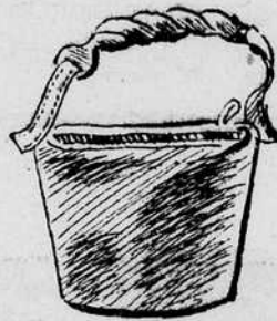
A bag of distinction . . . movie faille with top handle and zipper closing. Black only....$4.95 plus tax.