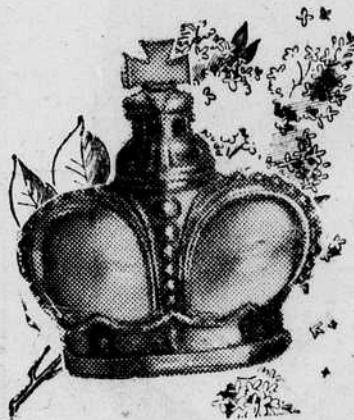
A perfume of distinction—Prince Matchabelli's best loved perfume Duchess of York.....$3.50 to $35.00 plus tax.