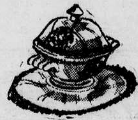
Silver of distinction—a covered entree dish of Old English Sheffield and Victorian plate. $40.00 plus tax.