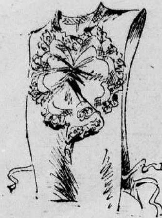
A Dickey of distinction . . . tailored, yet dressy, in white with lace trim. $4.00