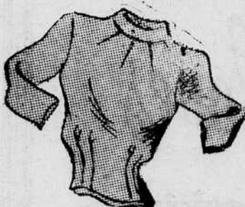
A blouse of distinction . . . a fine wool jersey turtle neck, back buttoned with push up sleeves. Black only.....$7.95