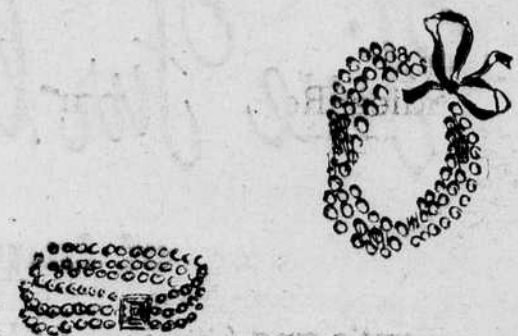
Jewelry of distinction . . . a three strand pearl choker with black ribbon tier.....$4.95 plus tax Bracelet to match.....$2.95 plus tax