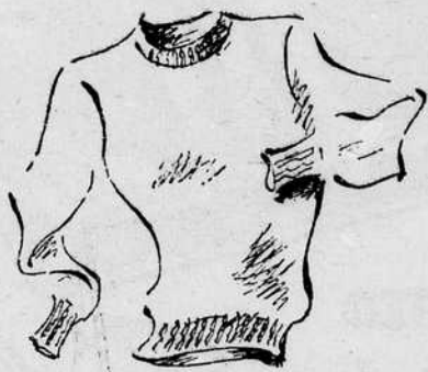
A sweater of distinction . . . Caledonear fine knit suit sweater in wonderful, wonderful shades. $6.95