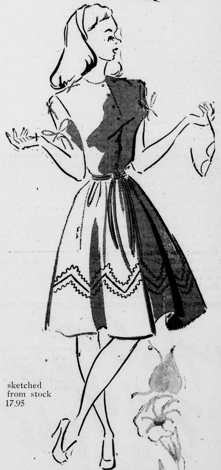
sketched from stock 17.95