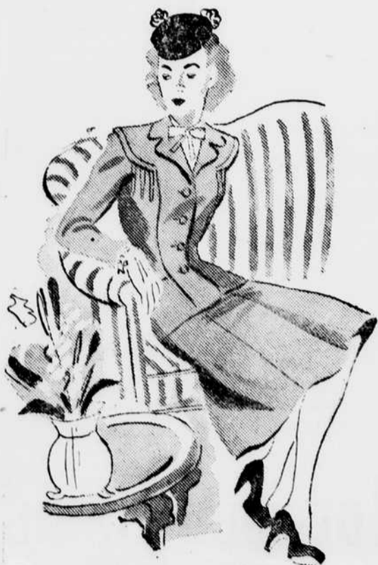
"The colors are as true as when the dress was new."