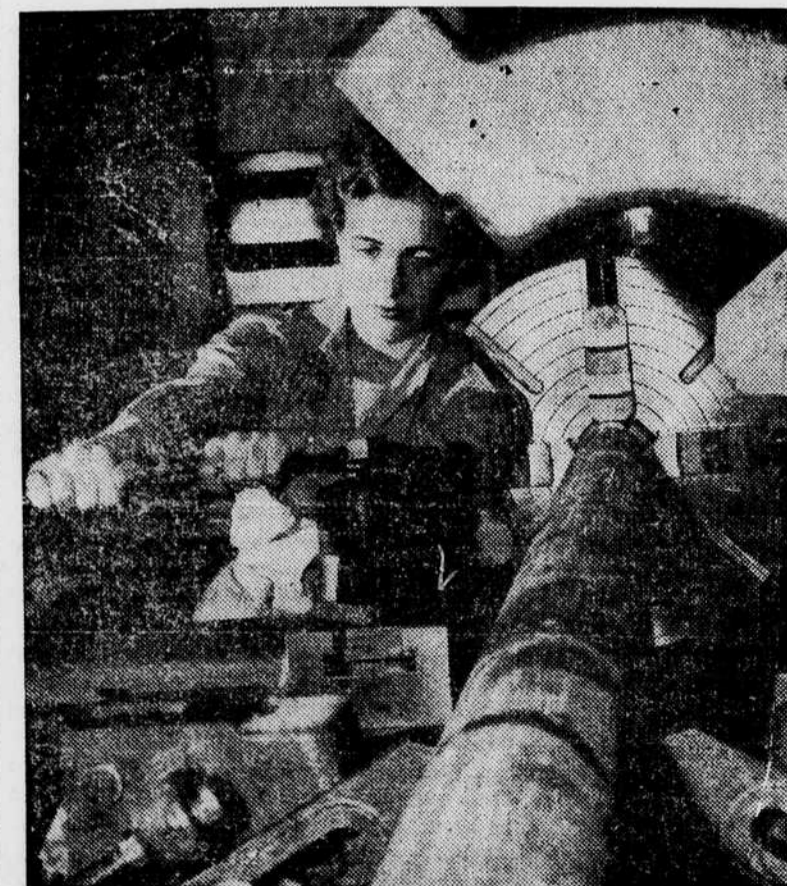
ILLUSTRATING . . .

For his activities in Aprista, which advocates social justice for the masses and the practice of freedom, he was twice exiled from Peru.