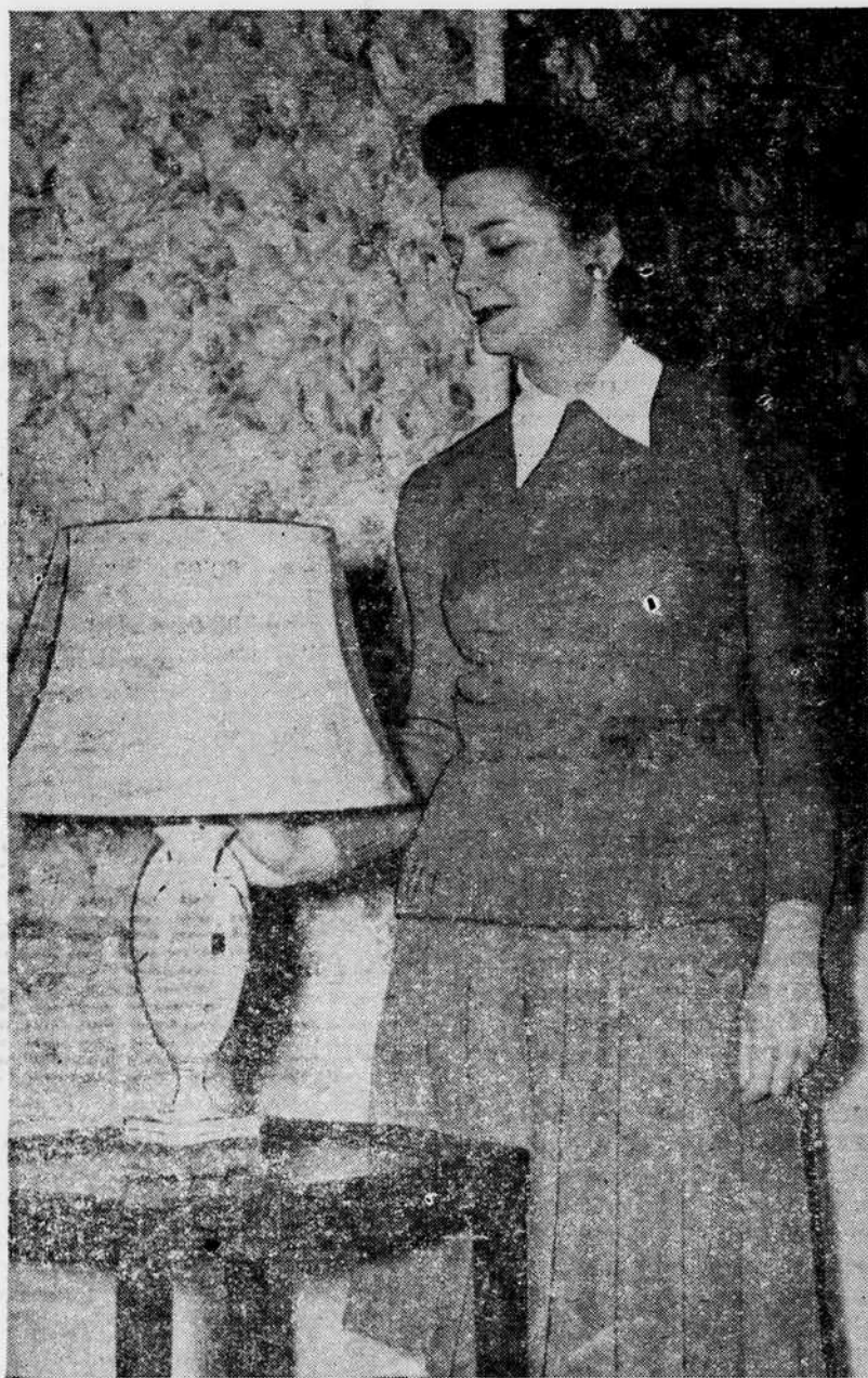
TO PLEASE THE . . .

This is the third number on the educational activities artist series.