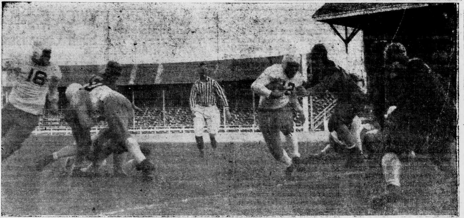
ARMYDUCK FOOTBALL . . .

To be eligible a girl must have at least one check, which is given for participation in every game and four practices of one sport. Those who have earned their check from the just-concluded volleyball tournament will be included in this initiation.