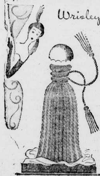
Gold Tassels Cologne • in a translucent golden glass tassel 1.00