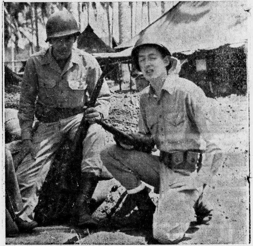
FROM OREGON TO GUADALCANAL ...

Conducted by experts who "know their onions", a special evening lecture series for victory gardeners was conducted this sea-