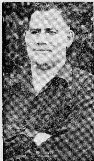
HONEST JAWN . . .