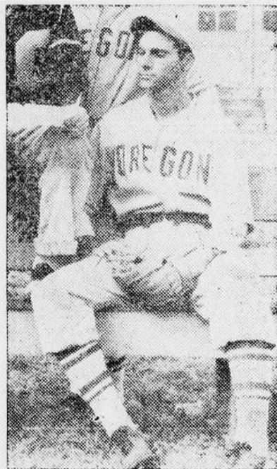
SLUGGING CAPTAIN . . .