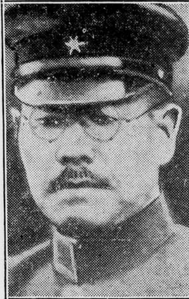
"OH, SO!" . . .

Several of the lads wearing SDX livery have been tendered oh-so-juicy offers by the N. Y. Yanks, St. Louis Cards, world champs, and the Philadelphia Phillies, to join the pro ranks. But these considerate laddies with a thought to the wishes of the sports seeing public of Eugene and environs, have spurned all offers, to remain