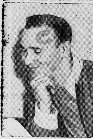
JOE'S STILL THERE . . . . . . Mr. Gordon is still covering a lot of infield territory for the New York Yankees. The former University of Oregon athlete may see another World Series this year.