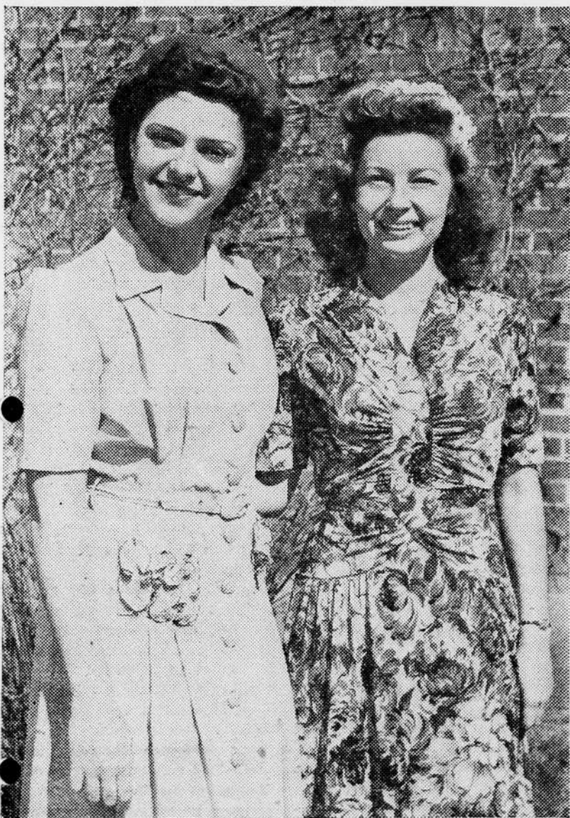
SISTER AND SISTER . . .

Late Per The dance is traditionally for- (Please turn to page three)