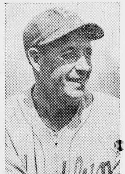
"BUMS" BIG HURLER . . .