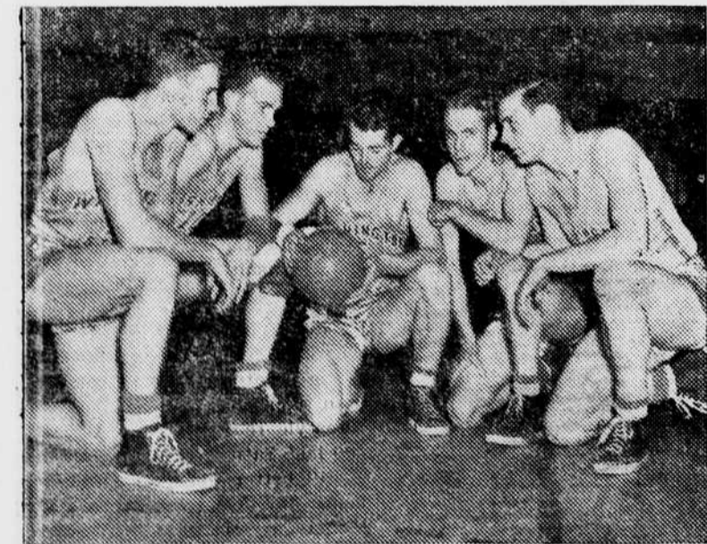
BOARD OF STRATEGY . . .