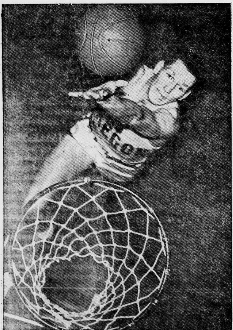
MELON MARAUDER . . .