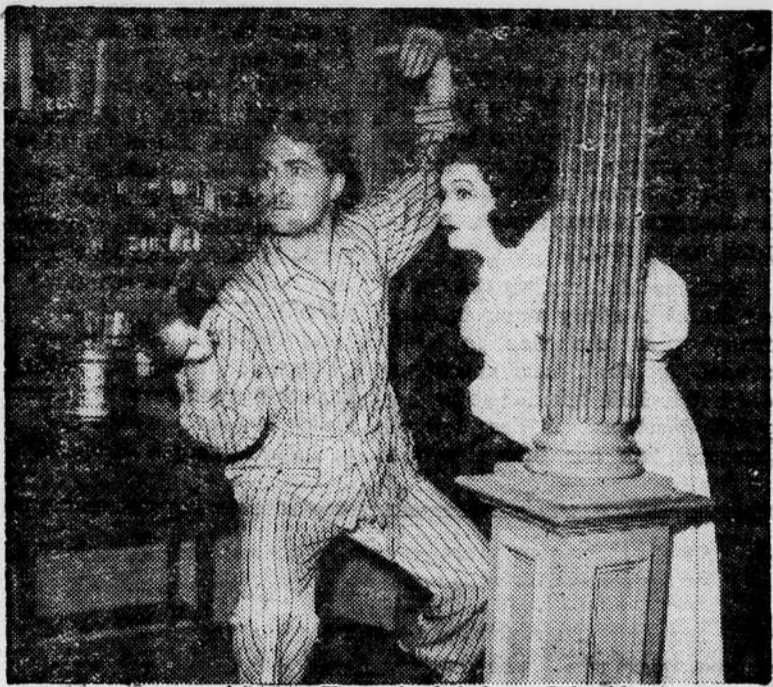
Loretta Young and Brian Aherne are shown in a scene from "A Night to Remember," which starts Sunday at the Heilig theatre.