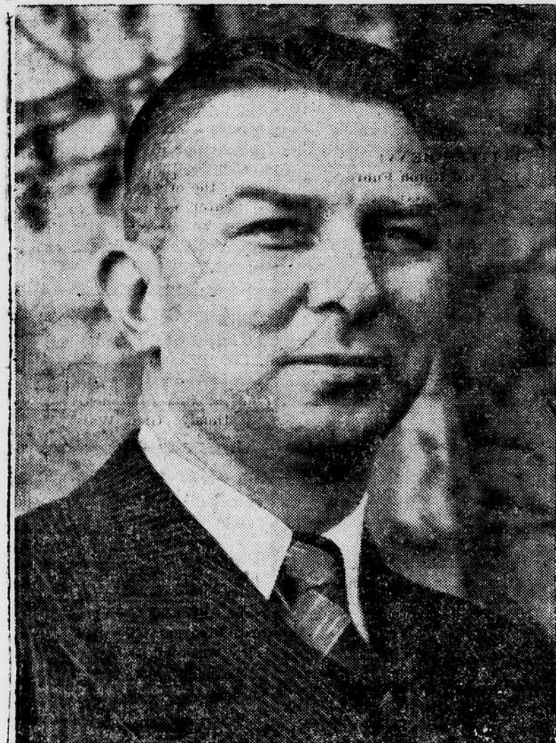
CASABA CHIEF . . .

Phi Delta Theta and the Han- (Please turn to page five)