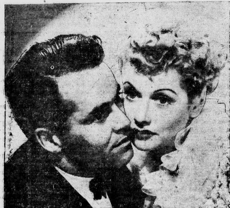
Damon Runyon's "The Big Street," which starts Sunday at the Heilig theatre features Lucille Ball and Henry Fonda, shown in a scene from the film.