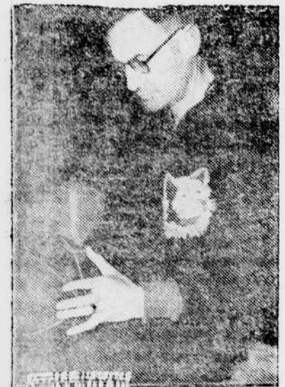
HEAD OF HUSKIES . . .

Originally from The Dalles and before that strictly from sensa-