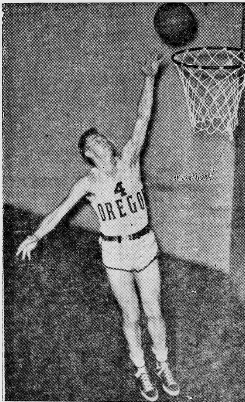
BURNS UP THE BOARDS . . .

Plan of attack for the Vandal in the second half was simple. It consisted of merely casting off time and again and praying the (Please turn to page five)