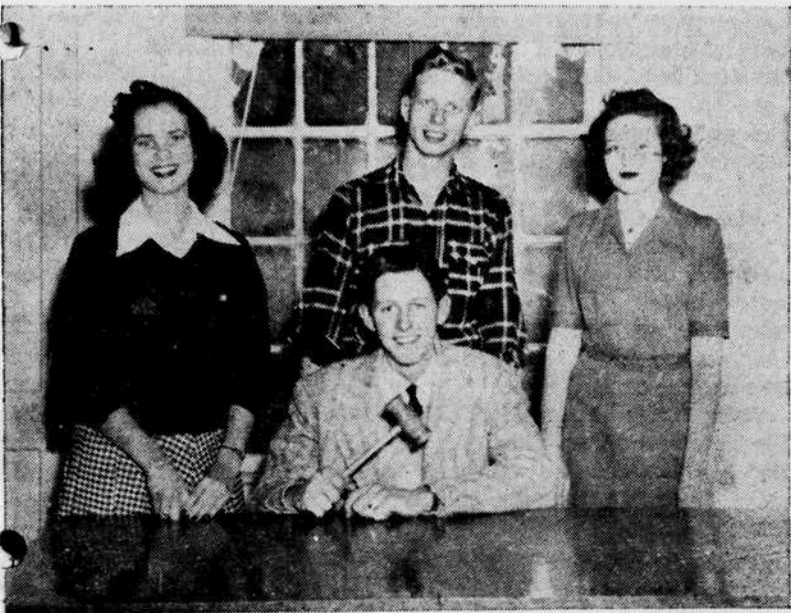
NEW FROSH OFFICERS . . .