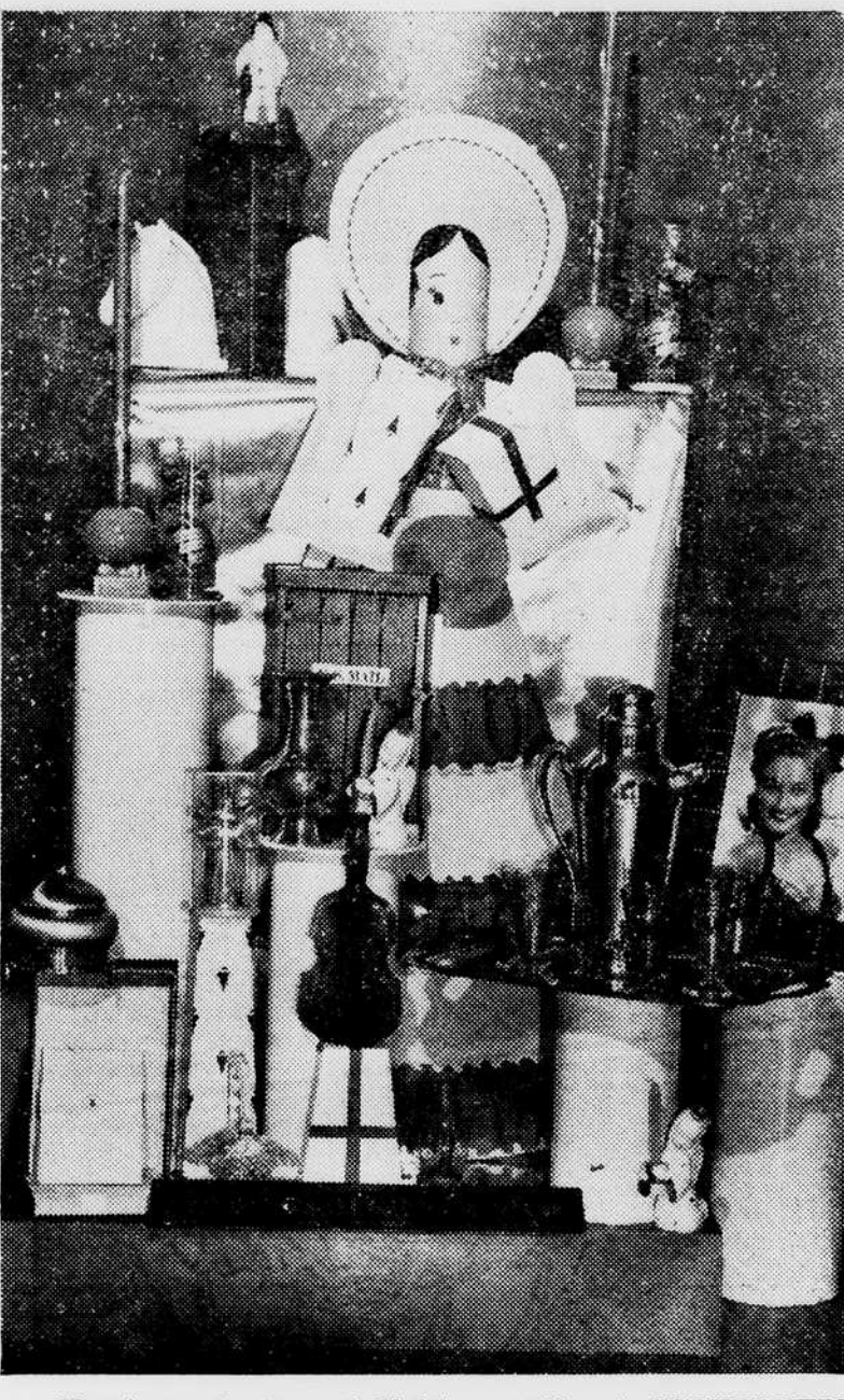
. . . There's no shortage of Christmas gifts at MONTGOMERY WARDS Company. Pictured here are only a few of the ideal Christmas presents for every member of the family.