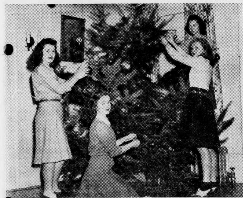
A TYPICAL SCENE . . .

The Alpha Delta Pi house won the weekly Red Cross work contest with a record-breaking total of 34½ hours. Total of all hours for this week was 100½.