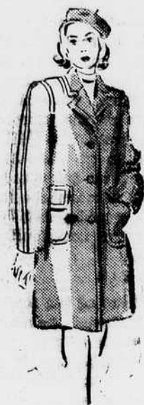
No Belt, Fly Front

Believe us, girls! Skinner's Tackle Twill is definitely the fabric for Oregon's "mist." The most noteworthy fabric developed this year—it doesn't just "repel" showers—it's WATERPROOF. The colors are nude and blue. At Russell's, naturally.