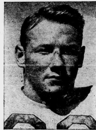
SOPH STANDOUT . . .