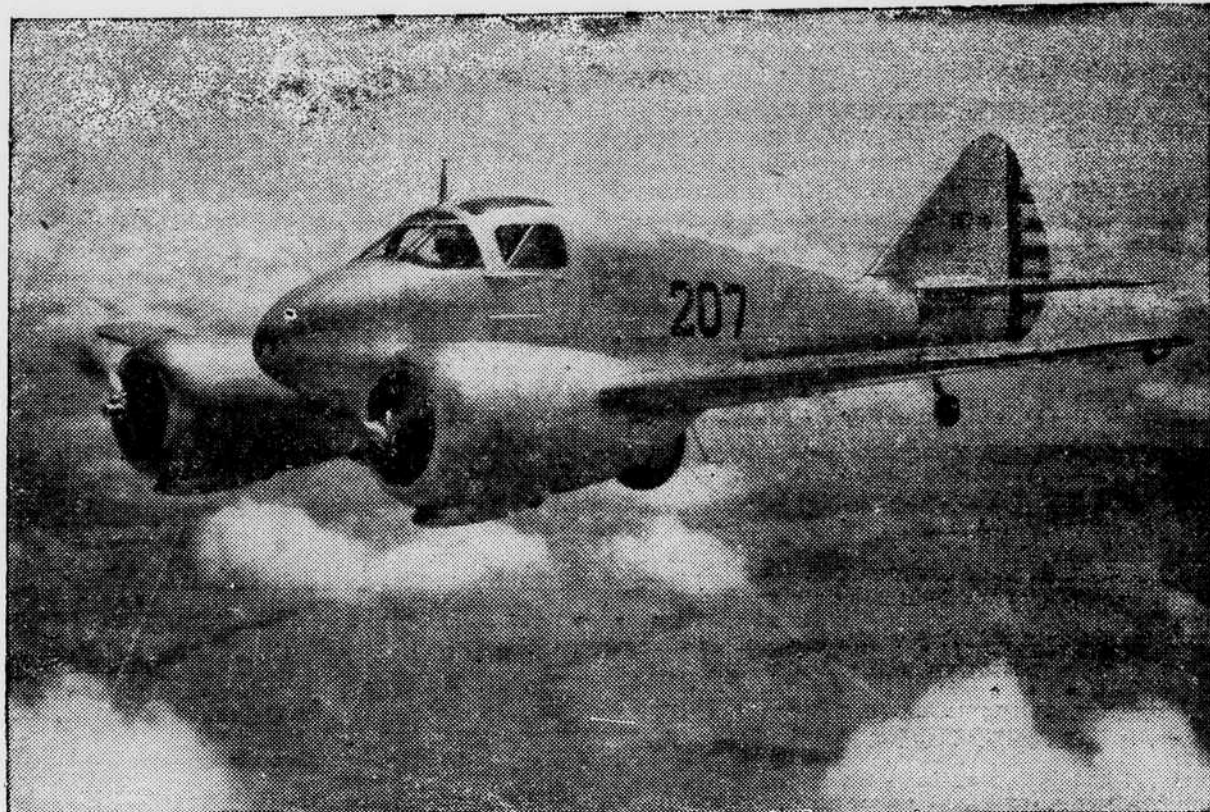
A twin-motored advance trainer roars over Ellington field, Texas, where every day more flying fortress pilots are being turned out.