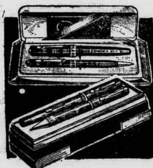
Scheaffer, Parker pens. Also the Esterbrook at $1.

CBA paper and leather notebooks for class notes. Special smooth finish paper, more for your money. No shortage—we've stocked up! Sport this real leather notebook with a Talon zipper too!