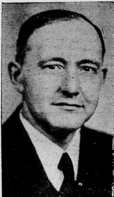
REVIEWING ROTC.. today will be Charles A. Sprague, governor of Oregon.