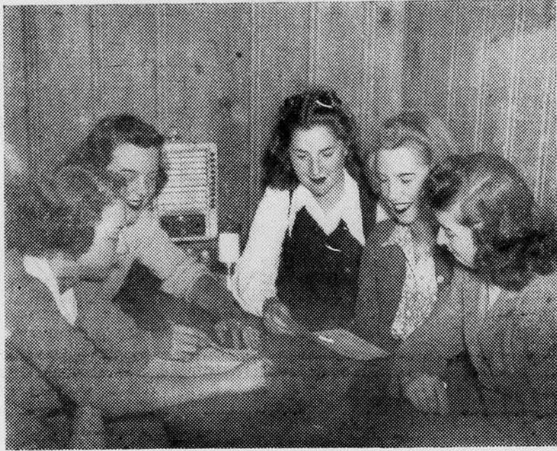
THE HOP HEADS . . .

The public has been invited to attend this lecture.