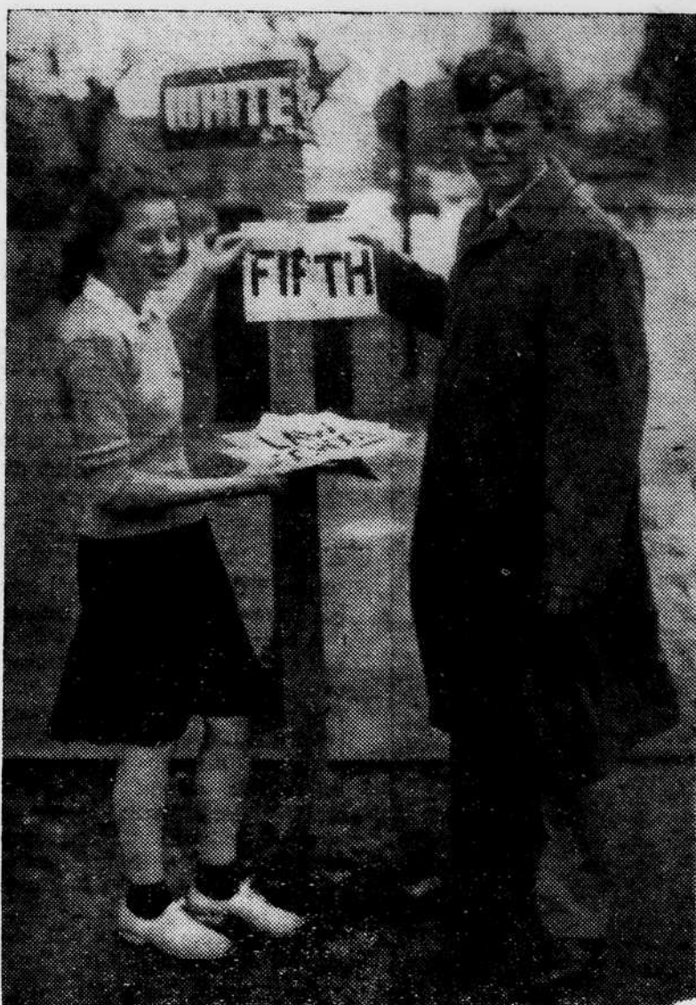
THE WORD 'FIFTH' . . .

It was also decided by vote that the singers should wear informal dress, that piano accompaniment might be used, and that men's and women's groups should