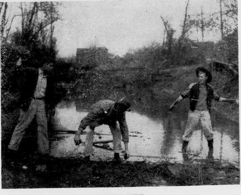
A LITTLE MUD . . .

More than 5,000 students signed up for war training or war informational courses offered by the University of Michigan this semester.