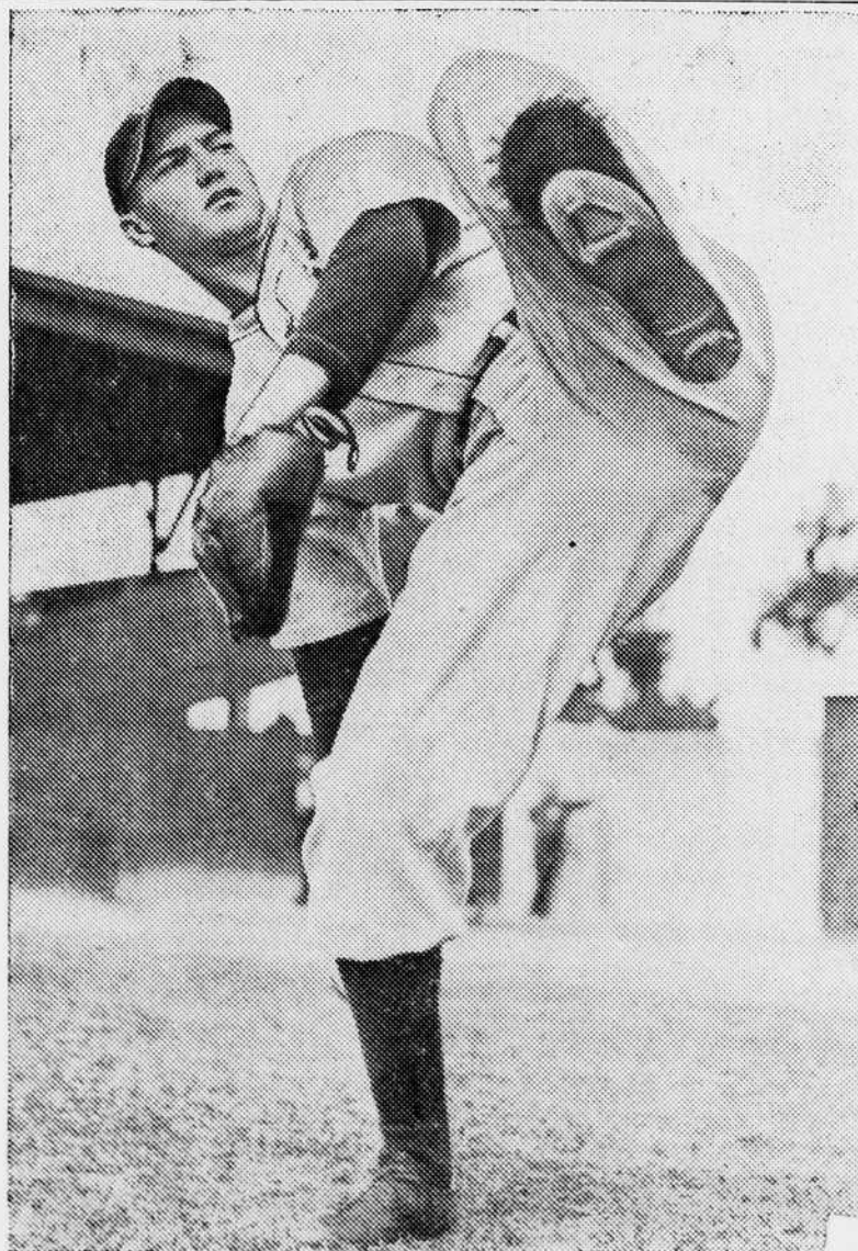
SCHOOLBOY ROWE . . .

. . . he hit the majors at an early age. Will he make good his comeback this season?