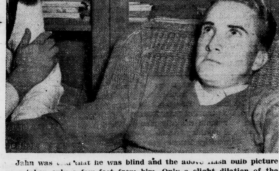
was taken only a few feet from him. Only a slight dilation of the pupils of his eyes was noticed.

At all stores selling toilet god (also in 10¢ and 59¢ jars)