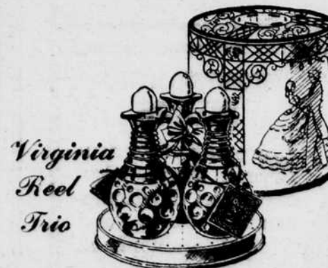
Virginia Reel Trio

MIRROR SET 4 Pc. attractive clear handles $2.29