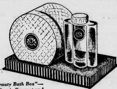
"Beauty Bath Box"—LeDandy Bouquet and Dusting Powder $2.75