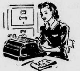
STUDYING . . .

Just look at all the activities, bicycling, football, rallies, shopping, bridge, dancing, and a host of others not pictured to keep every Oregon coed busy from morning till night. That's what makes college life so enjoyable.