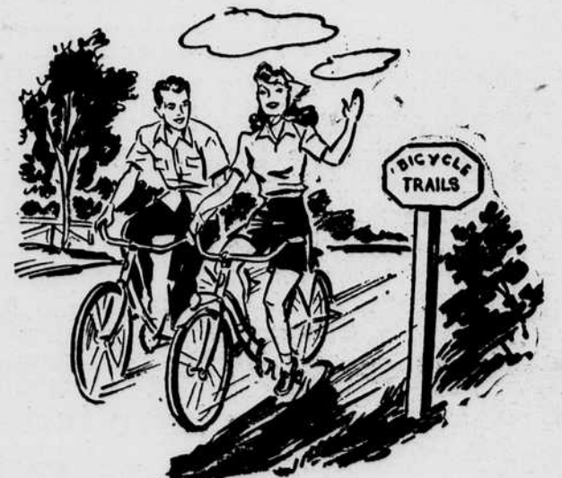
RECREATION . . .