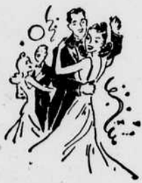
DANCING . . .