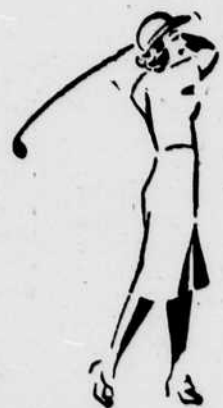
SPORTS . . .

Visit Hadley's for your first "class" at Oregon.