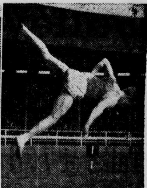
For a record.