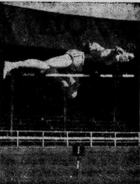
At the top