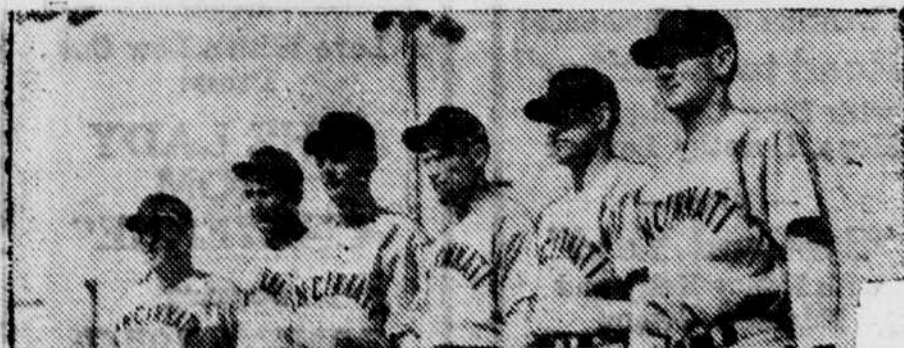
Rookie Cincinnati Reds line up for the cameraman.