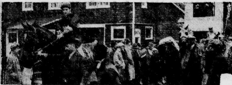
Bangtails parade to open eastern track season.