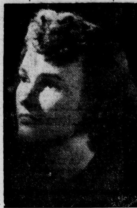
The curtain on the University theater's activity for 1940-41 will fall tonight, as the production, "Tovarich," ends tonight. Appearing in prominent roles are these three student actresses. They are,