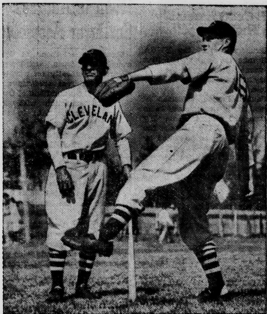
A couple of Cleveland Indians play around in spring training. A long season lies ahead.