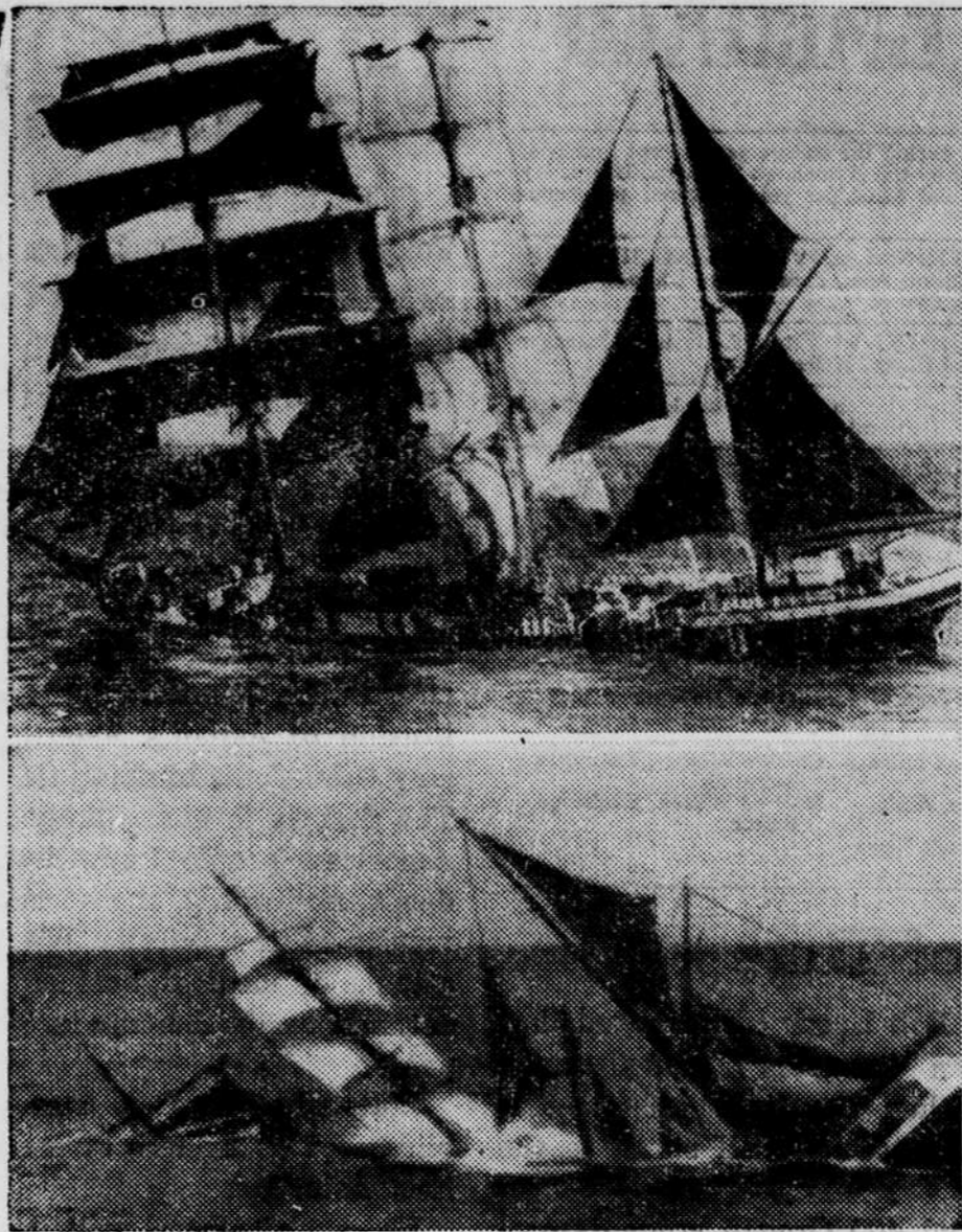
These scenes are not from a movie, nor are they from wars in the days of old. Using every type of ship in their harbors to break Germany's counter-blockade, the British have sent sailing vessels like this one to sea. In the top picture the schooner lists after being hit by bombs from a German plane; in the lower picture she is on her way to Davy Jones locker.