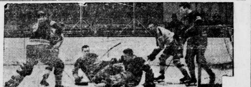
Scenes like this may be enacted at Oregon, should a proposed adding ice hockey as a major ice coliseum be built in Eugene, sport.