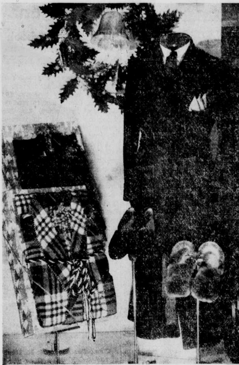
Here's a scheme to delight his heart. There's the smooth combination of lounging robe and leather slippers for "dress-up" wear and the warm robe and fleece slippers combination for comfort on chilly winter nights.