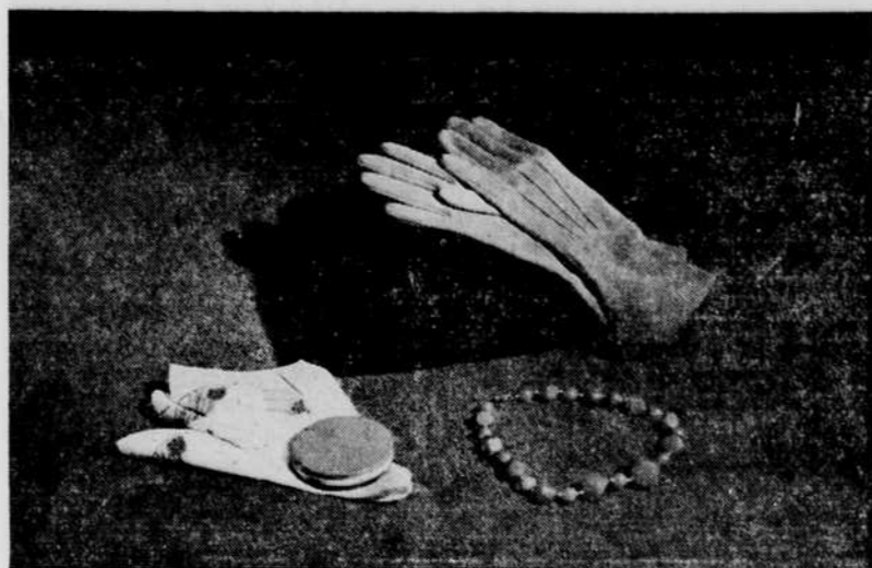
These accessories will light the patriotic fires in milady's heart: the bright red of the suede gloves in milady's heart; the round powder compact is splashed with stars and the American flag.