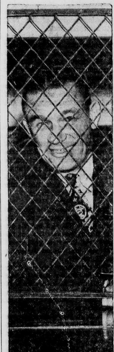
Rube Marquard, one of baseball's greatest pitchers, demonstrates his delivery dishing out mutual tickets from behind a wicket at Haleah Park race track at Miami, Florida. Rube pitched for the Giants.