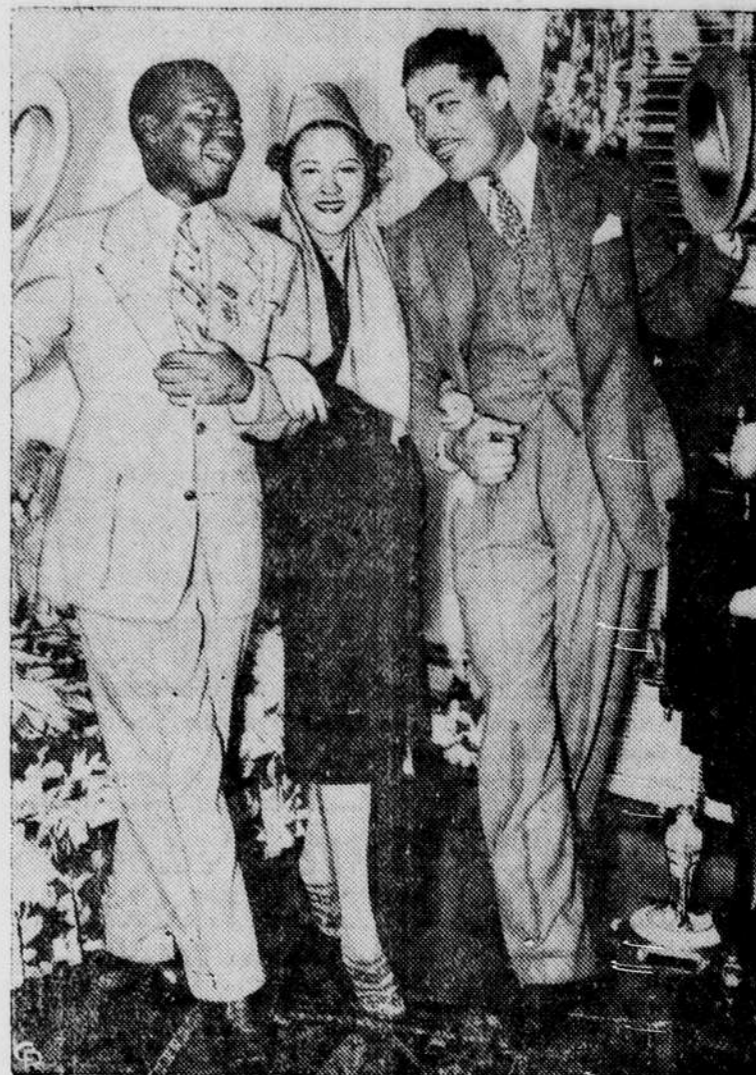
Joe Louis, shown above with his wife and dancer Bill Robinson, doesn't seem to be at all worried about his bout with Arturo Godoy. Louis meets the Chilean heavyweight this Friday.