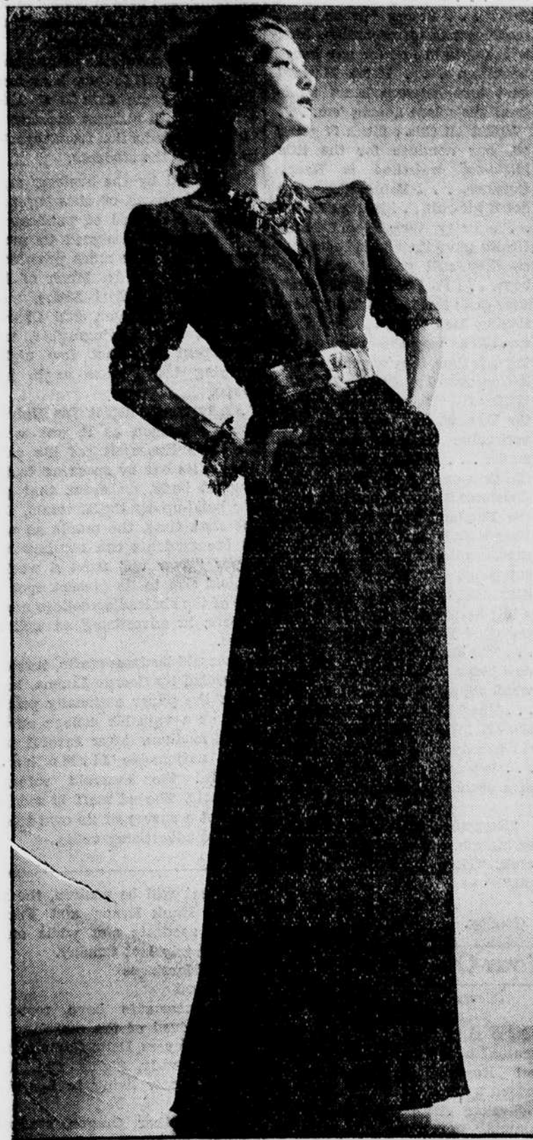
It's just such a dress as this that proves an eye-snatcher at campus formal and house dances. Glamour and simplicity are combined in this stunning dinner gown of two-toned crepe in red and black, with the new peg-top skirt and gold kid belt. The importance of gold is stressed again in the gold-finished leaves which strung on a chain are worn as necklace and bracelet.