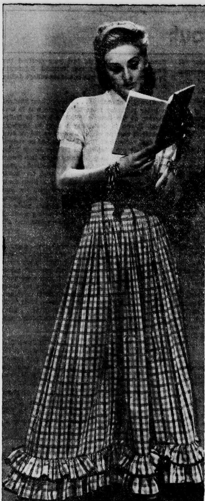
Gypsy Spirit Prevails in Dress