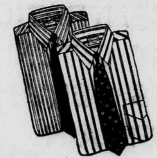
Cluett, Peabody & Co., Inc., Troy, N. Y.

False. The swing is all toward shirts in subdued colors and simple patterns. Choice examples of this trend will be found in the new Arrow shirts . . . $2 up.