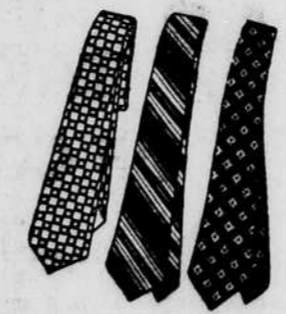
If it hasn't an Arrow label, it isn't Arrow

True. Arrow ties at one dollar (and one-fifty) receive the finest tailoring a tie can get. And, being styled by America's foremost authority on men's fashions, their patterns are faultless.