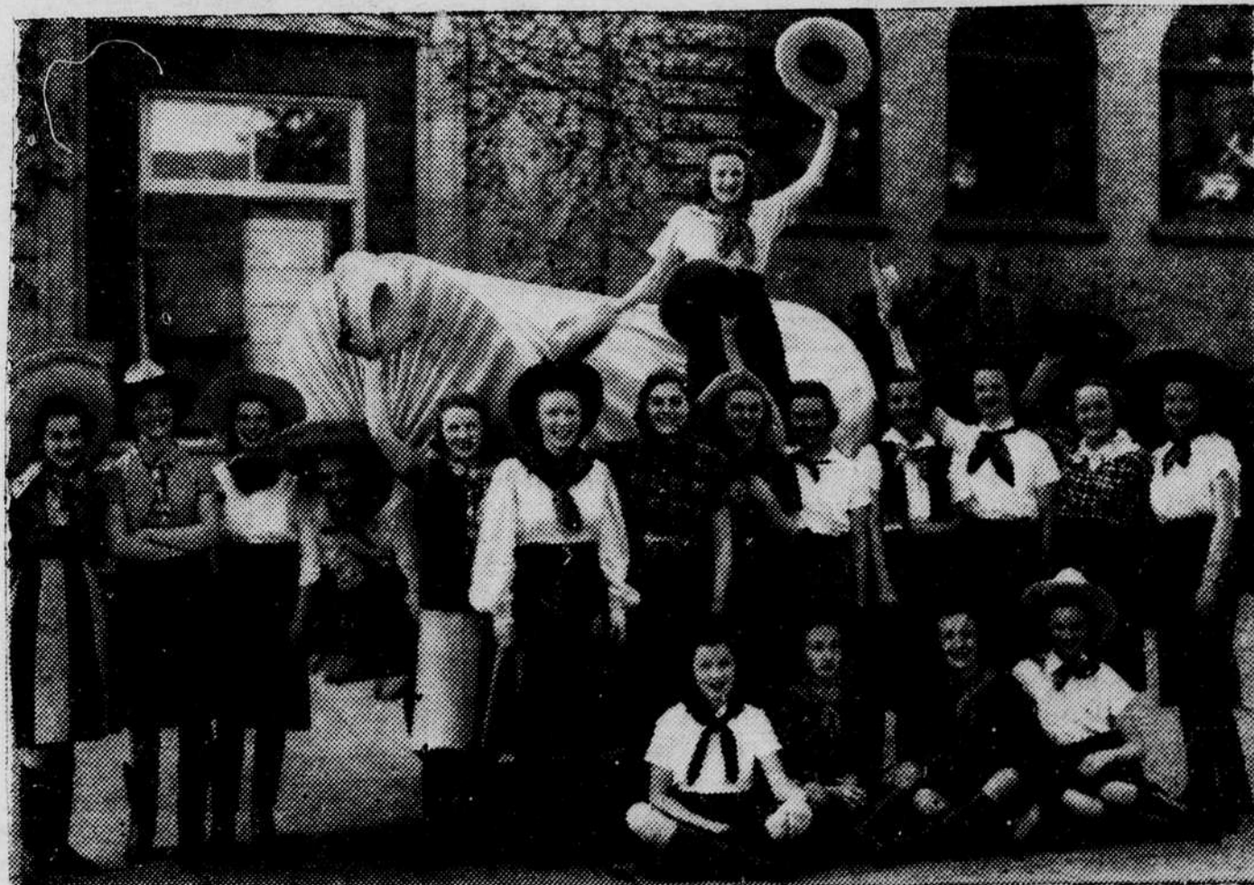
The twenty "best dates on the campus" . . . to be auctioned off at the AWS carnival tomorrow night.