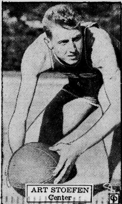
ART STOEFFEN Center