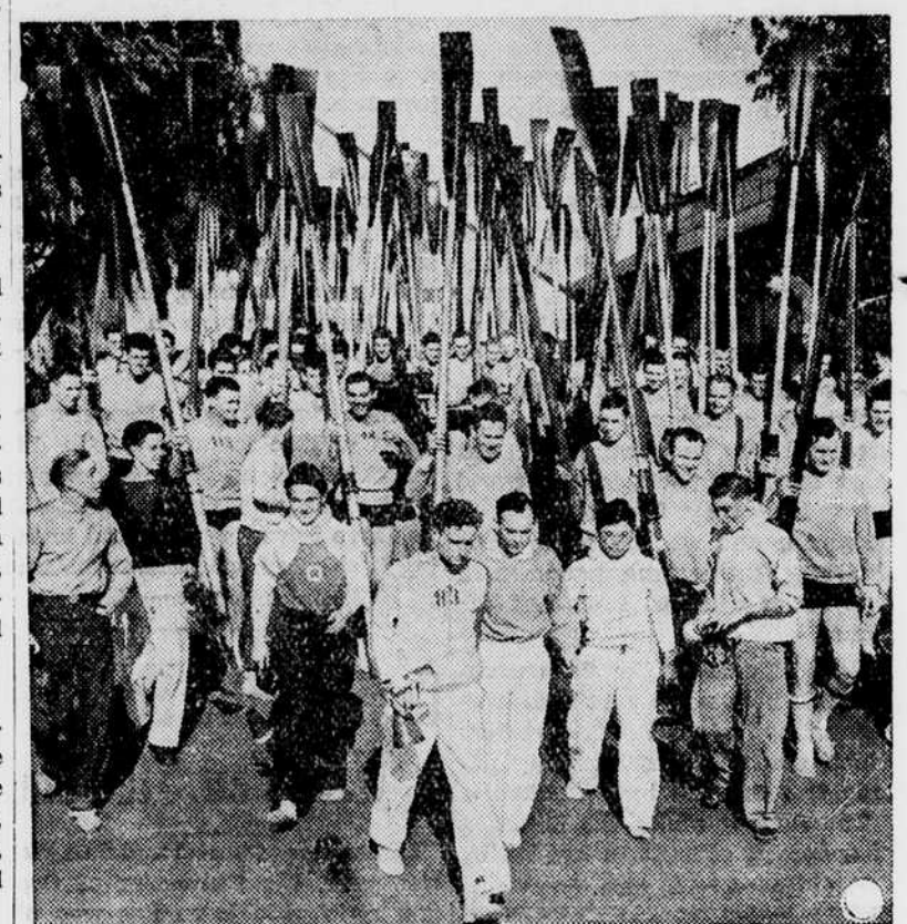
It's the famous California Golden Bear oarsmen turning out for spring practice.